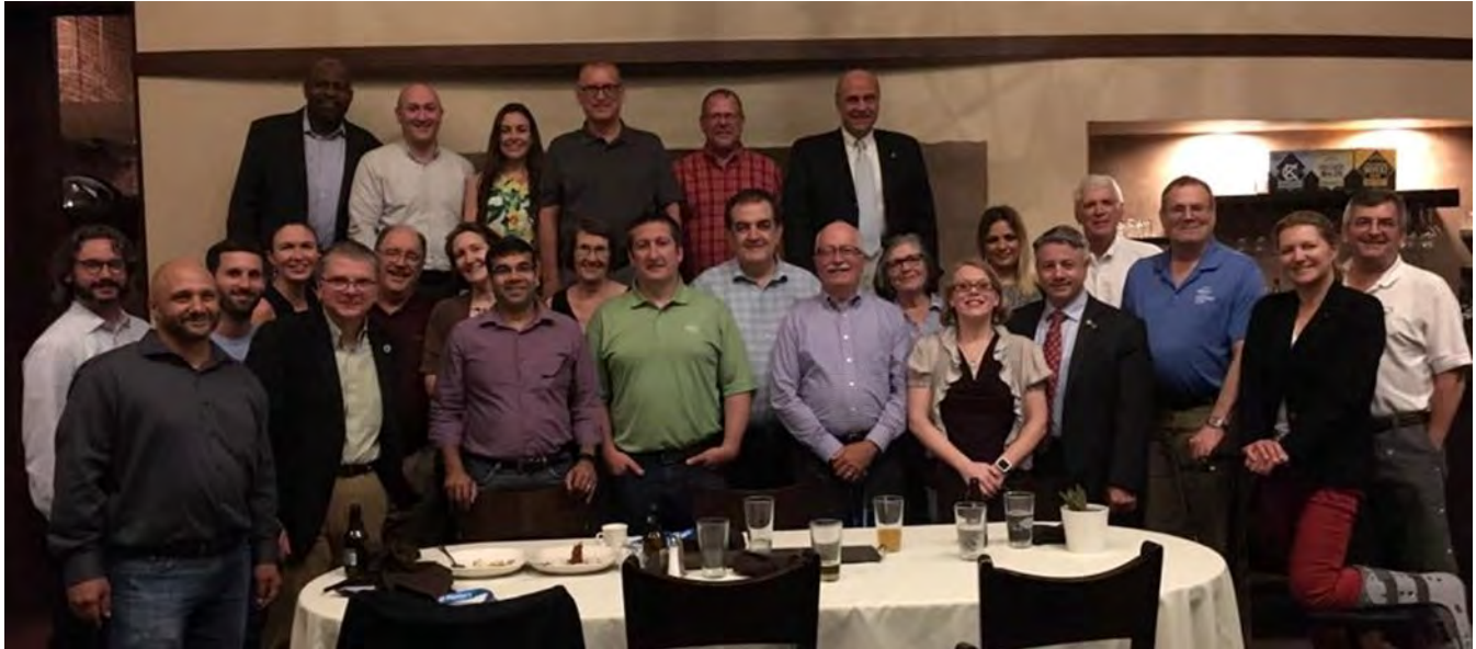
2019 Annual Conference in Kansas City - Region 3 Dinner